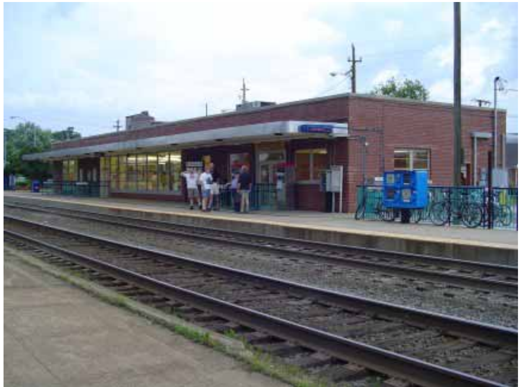
Club members gather at the first official club meeting at the Quantico Train Station.