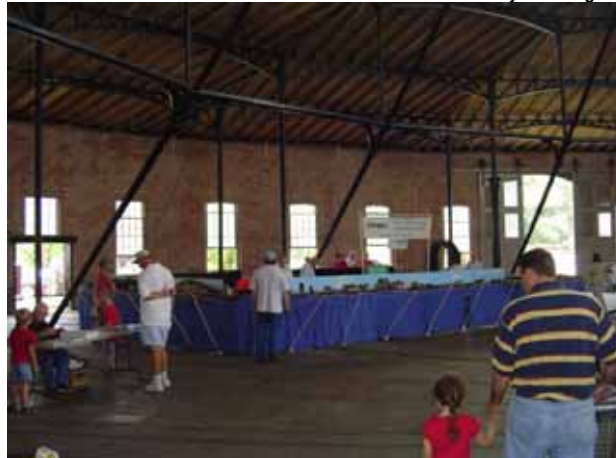
Crowds enjoyed PWMRC's layout at Rail Days.