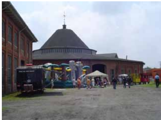
Significant improvements were made to the roundhouse and adjacent structures.

to provide a few free standing fans to help cool us down. The round house had seen more renovation since we were there last year. New windows, paint and less dust were evident. All in all, we had a great weekend.