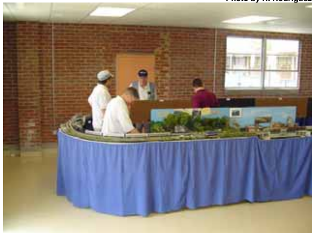
PWMRC set up a nice modular display for our 1 st open house. The permanent layout construction was due to start a few weeks afterward.