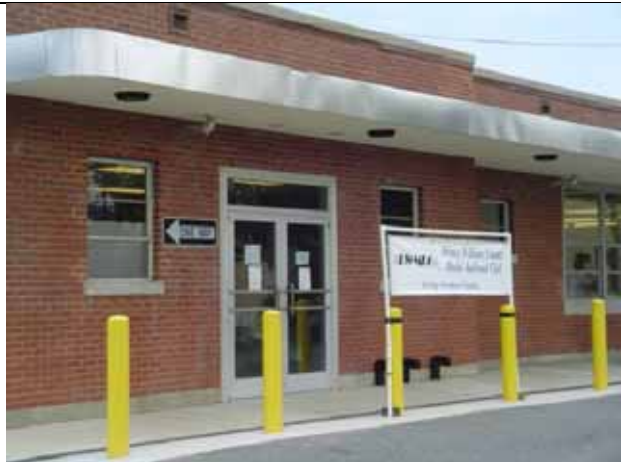
The PWMRC banner adorns our new home at the Quantico Train Station.