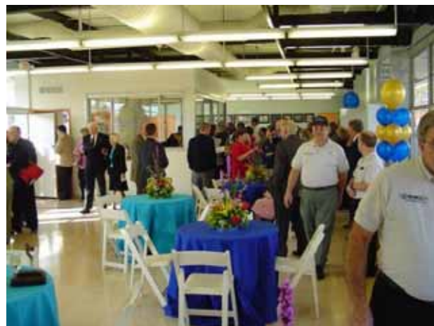
The main passenger waiting area was nicely decorated for the Grand Reopening.

Well a wet Spring warmed up to a hot summer real fast. PWMRC participated in several events this summer. First and foremost, we participated in the Quantico Station Grand Reopening Ceremony in April. We set up a modular layout in our new home, the South Room of the Quantico Station. The event was a catered affair by VRE, with the Marine Jazz Band, many politicians speaking on behalf of the train station, and numerous tours of the station and our layout. After 12 years of discussions, we had finally arrived at our final destination.