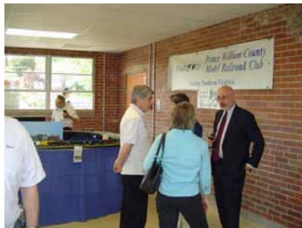
Club members chat with County Officials during the Grand Reopening, which featured a modular layout by PWMRC.

In July, we held our first formal open house at our new home in Quantico. Despite less than 2 weeks notice, we had a fair size crowd and we even earned some donations and a few new members. We ran trains for most of the day and enjoyed speaking with visitors, while watching 1:1 scale trains running past the station throughout the afternoon.