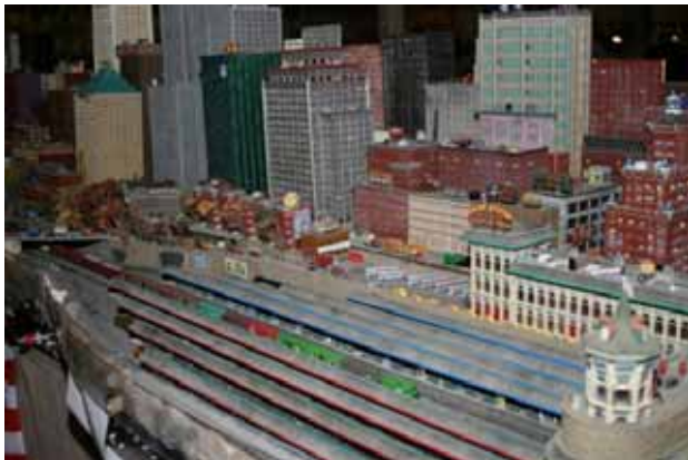
A really big city along the line on the N trak layout.