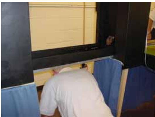
Some old dogs can't be taught new tricks!!!

The bridge has two inch high sides to keep trains from falling off to the floor. It is about 8 1/2 inches wide, with the rails equally spaced from each side. General structural stability and light weight was achieved by laminating 1/4 inch Luann mahogany plywood to strips of 3/4 inch fir. One layer of plywood was installed on the bottom and two layers on top. Two of the fir strips are under the center line of the rails. Even though the structure is hollow in between, the fir strips keep the entire structure rigid.