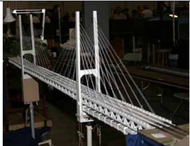
A beautiful suspension bridge courtesy of a Japan N trak club.