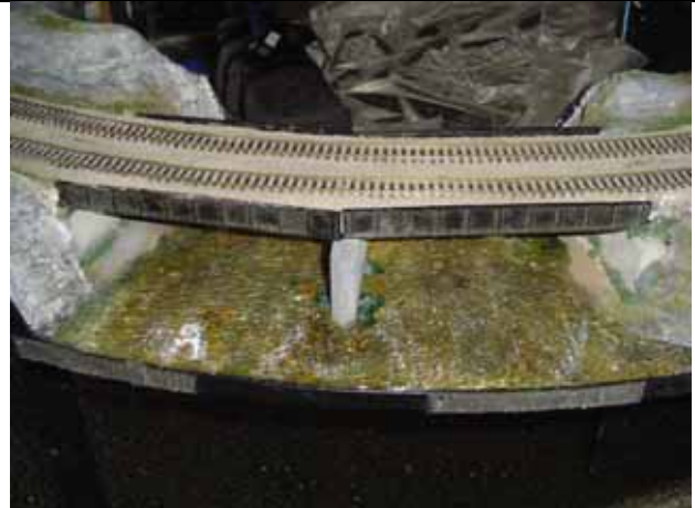
Thanks to Brion Boyles and several other members, the refurbished corners looked great.....even on a rainy day!

As we enter Fall, turn around and look back at the busy summer we had in PWMRC. We started off June with a rainy Manassas Railfest. Through our combined resources and a little luck we were able to pull off a successful show in spite of the weather. We also showed off our refurbished corner modules which had been in serious need of work after years on the road.