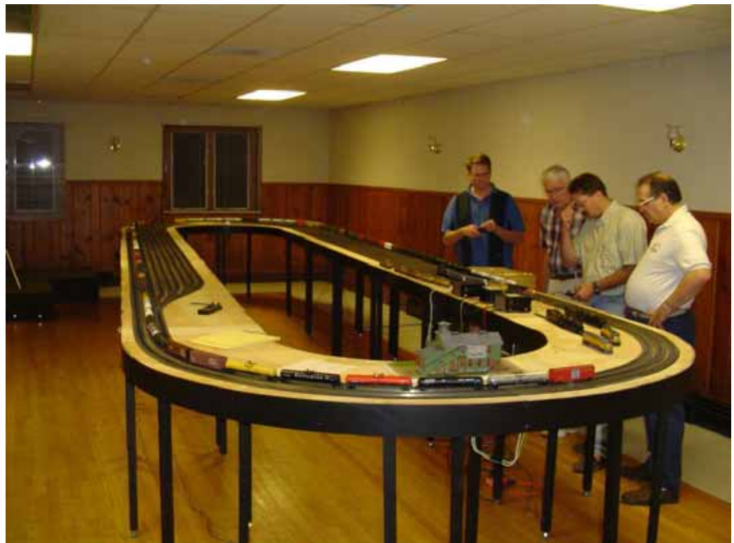
Members prepare for the 2 nd Annual Loco Pull at the Arcola Volunteer Fire Department

The second Annual Loco Pull was held at the Arcola Volunteer Fire Department. The annual event experienced a rain delay due to the remnants of Hurricane Jeanne, which drenched the area with heavy rains and gusty winds. Originally scheduled for September 28 th , the event was delayed until September 30 th . The course was extended this year by a quarter scale mile for a total of 1 ¼ miles.