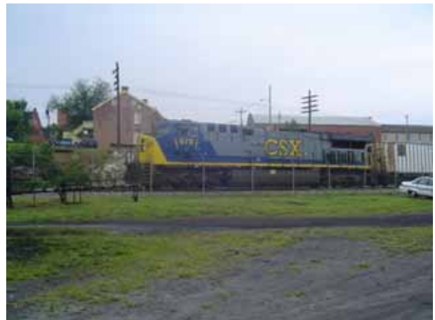
The 1:1 scale action was a real show stopper.

In July we headed off to West Virginia for two days of train running in Martinsburg, West Virginia. Besides model trains, we were treated to live bands, including the Drifters, live trains (the CSX mainline was right next to the festival, Civil War re-enactors, good food, good company and a lot of fun.