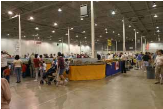
The N-Scale layout spread out over the size of a football field!

In August, we headed to the Dulles Expo Center for Greenberg's Train and Toy Show which was held in conjunction with the N-Trak Capital Limited Convention. The Ntrakkers assembled the largest n-scale modular layout in history. A total of 525 modules from 31 states and 6 foreign countries were put together to create a massive 70 scale mile model railroad empire. With the use of Digital Command Control, trains were able to maneuver over the layout in about 1 hour!