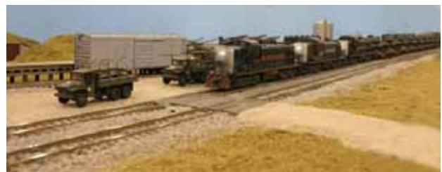
The convoy train is almost ready on Robin Barrows' military air base modules. Northern Virginia N-Trak, who helped sponsor the show, donated a portion of the convention proceeds to several local charities.

PWMRC assembled an impressive 24 x 40 foot layout for the joint show which was attended by tens of thousands of visitors over the weekend. The local media was present to publicize the event which helps raise the awareness of model railroading.