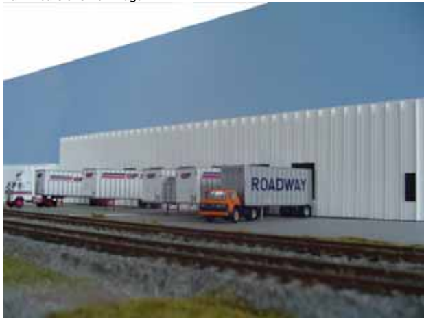
Fred Singer's warehouse module made its debut.

In August, we headed to the Dulles Expo Center for Greenberg's Train and Toy Show which was held in conjunction with the N-Trak Capital Limited Convention. The Ntrakkers assembled the largest n-scale modular layout in history. A total of 525 modules from 31 states and 6 foreign countries were put together to create a massive 70 scale mile model railroad empire. With the use of Digital Command Control, trains were able to maneuver over the layout in about 1 hour!