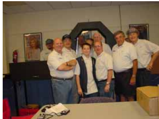
Members pose in front of the finished bridge at Central Library.

The bridge had its first trial run at the Central Library show in September. Although the micro switches were not installed at the time of that show, the bridge worked fine.....except for one erroneous moment when it was raised while a train was passing over top. To everyone's surprise, the airborne locomotive landed safely on the other side, all flanges to the rails and kept on going!!!!