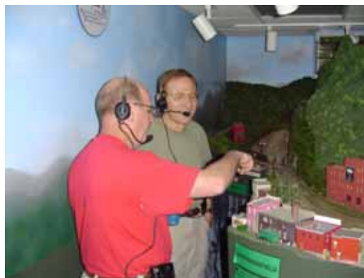
Operators work out a switching maneuver on the NCL

I created trains which had specific jobs and several other positions for each ops session. The jobs involved through freight, local freight, coal trains, passenger trains, yard switcher, dispatcher and yardmaster. Each of these jobs was vital to moving commerce across my empire. I established industries that served on line and off line interests. I purchased computer software which helped me figure out the logic of car forwarding and provided lists of instructions for my train crews to work from. I studied about fast clocks and train scheduling and incorporated their use into my ops sessions.