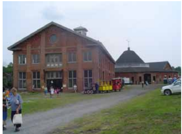
The historic B&O Railroad Shops and Roundhouse provided a great setting for the weekend festival.