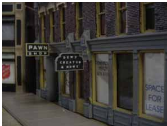
Visit Our New Law Offices in Downtown Nickel City, Pennsylvania.