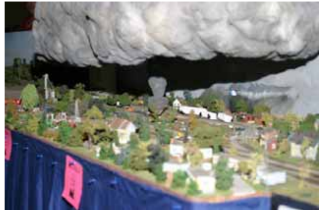
Tornado alley featuring an animated tornado was a "hit" at the convention.

PWMRC assembled an impressive 24 x 40 foot layout for the joint show which was attended by tens of thousands of visitors over the weekend. The local media was present to publicize the event which helps raise the awareness of model railroading.