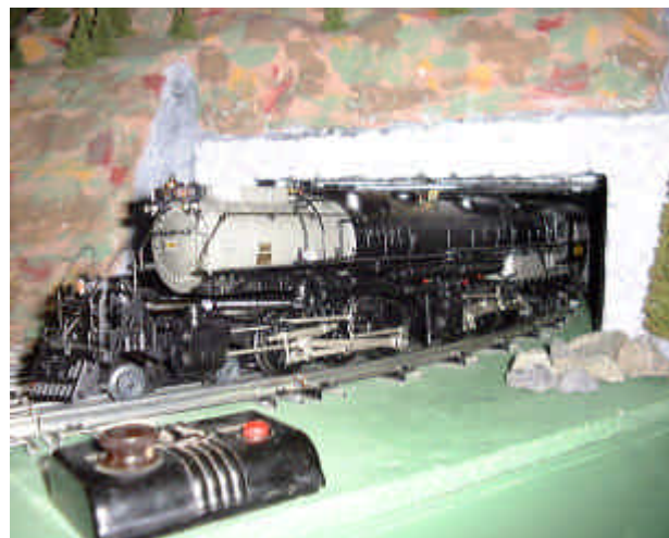
A steam train exits one of the tunnel portals on the Danielson's home layout.

The operating layout that they have is typical of a model train layout with buildings, bridges, and other scenery that is of high quality and detail and can keep anyone who participates in the model train world there for hours on end watching the trains go by on the rail.