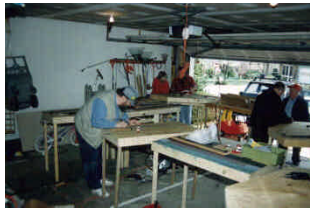
PWMRC module construction in winter 1995.

Thanks to everyone who came out, we had a good time and with luck we'll have a batch of new modules to admire and run trains on in the near future.