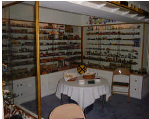
A table setting offers some of the many delicious snacks offered to PWMRC members during their visit.

his many sales trips during which he sought out the local train stores. Dan even showed those of us in attendance the first train he was given when he a youngster. Hope, on the other hand, not only collects train-related items but also collects miniatures. All of these collection items were displayed on shelves and in cabinets that allowed them to be examined in detail. Hope and Dan also have a significant quantity of railroad memorabilia of items such as newspaper articles, railroad passes, and the like that takes you back to the era when passenger railroads were in abundance.