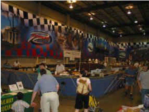
PWMRC set up a large 32' x 48' layout at GATS - Richmond.