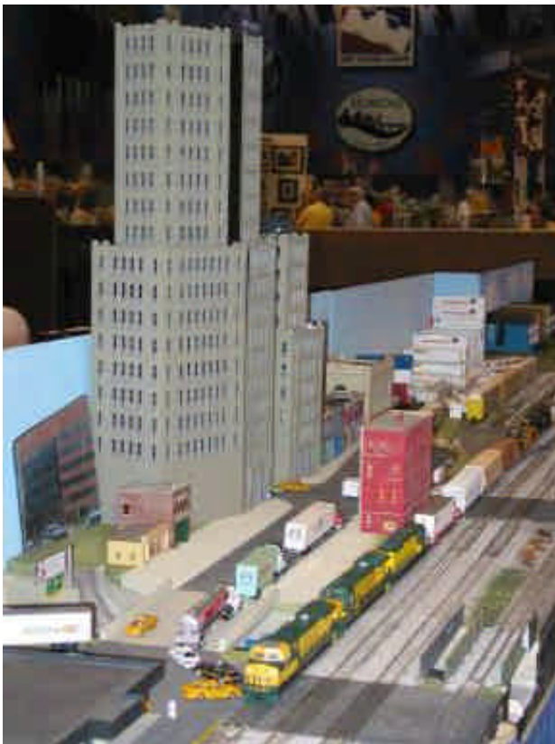
Tall buildings dwarf the scale trains on Lynn K's Big City module.