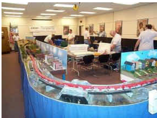
Club members operate trains in the Central Library Community Room.

In May we traveled to Central Library for one of our annual library shows. Despite the wet weather, the crowds were light. Yet, any excuse to run trains is a good excuse and there were plenty of trains running at the library throughout the weekend.