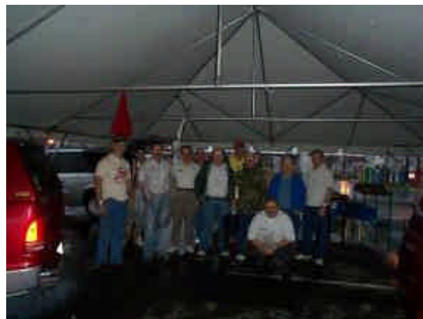
PWMRC poses for the first annual Manassas Rainfest.