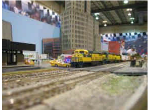
The local police have their hands full taking an accident report on the taxi that rain the crossing signal. I hope the driver didn't leave the meter running!